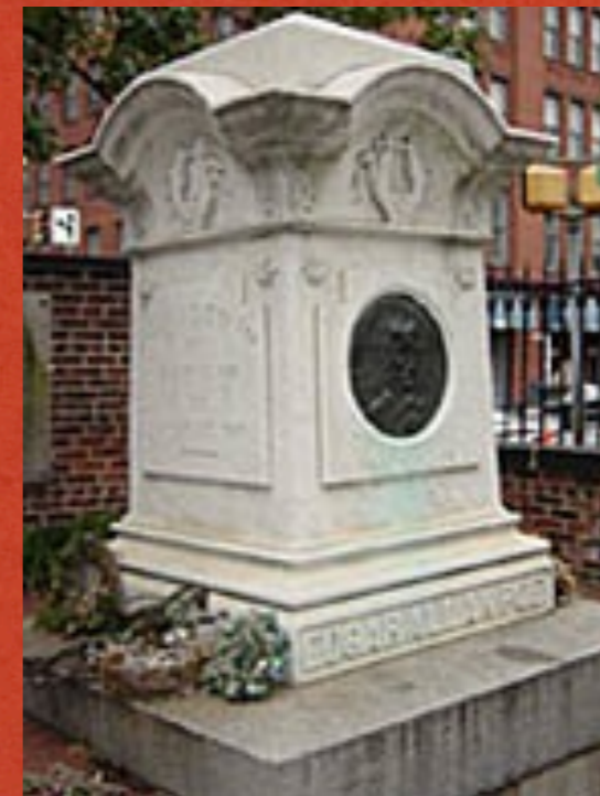
Memorial erected to Poe in Baltimore. Money raised by local school children.